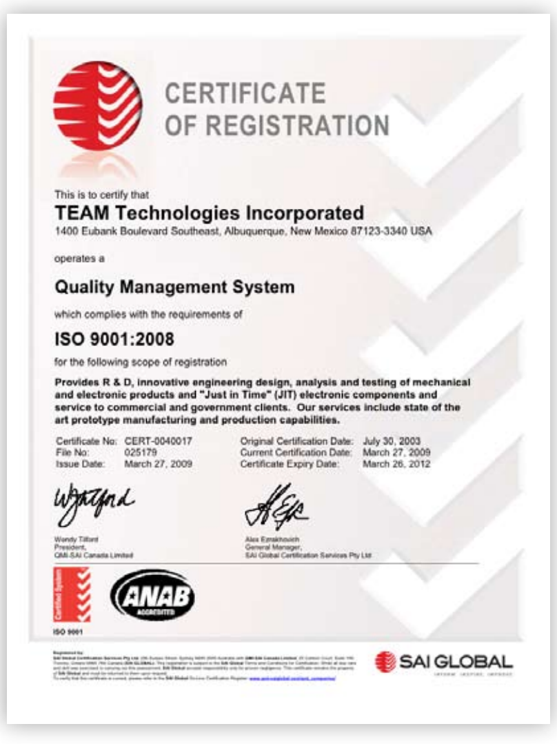
ISO 9001:2008 Registered